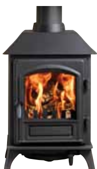
Riva Plus Small Woodburning with low canopy

* When fitted with a Smoke Control Kit and used in accordance with the user instructions.