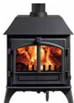
Riva Plus Medium Woodburning with low canopy

* When fitted with a Smoke Control Kit and used in accordance with the user instructions.